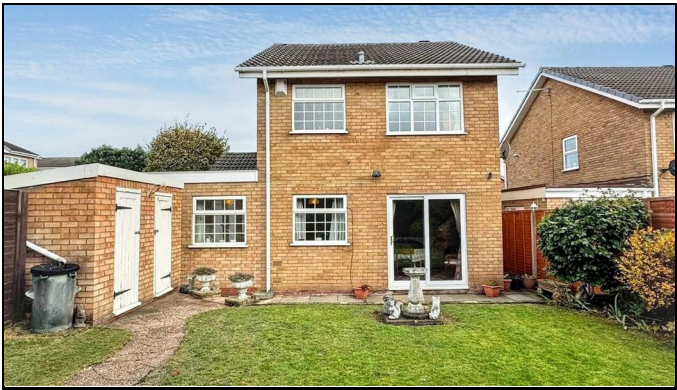
Lytham Close, Sutton Coldfield, B76 1XS